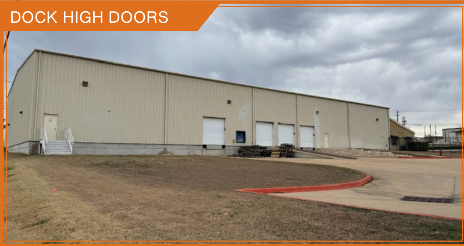
DOCK HIGH DOORS